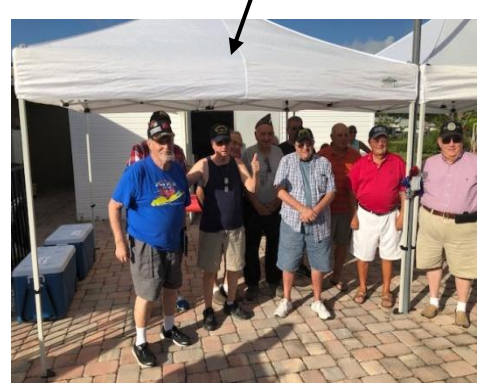
Thank you for your service!!